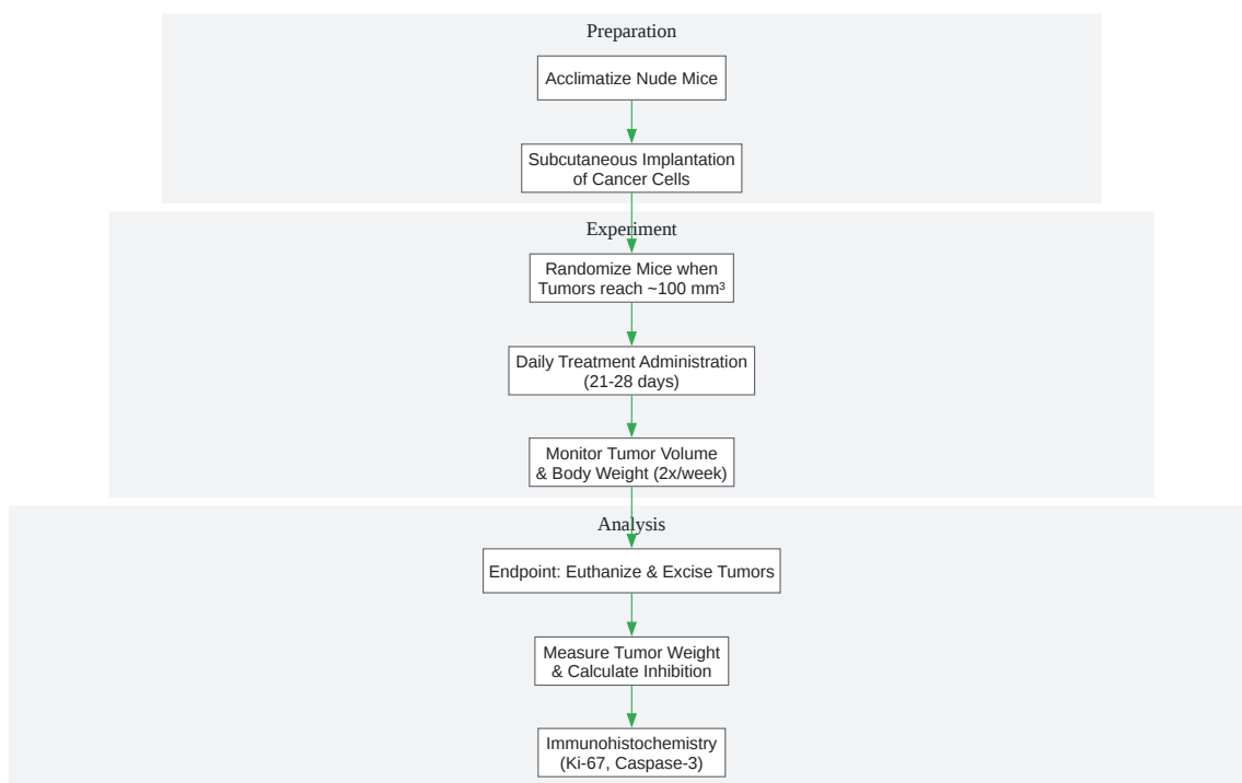
Experimental Workflow for Xenograft Study

Click to download full resolution via product page