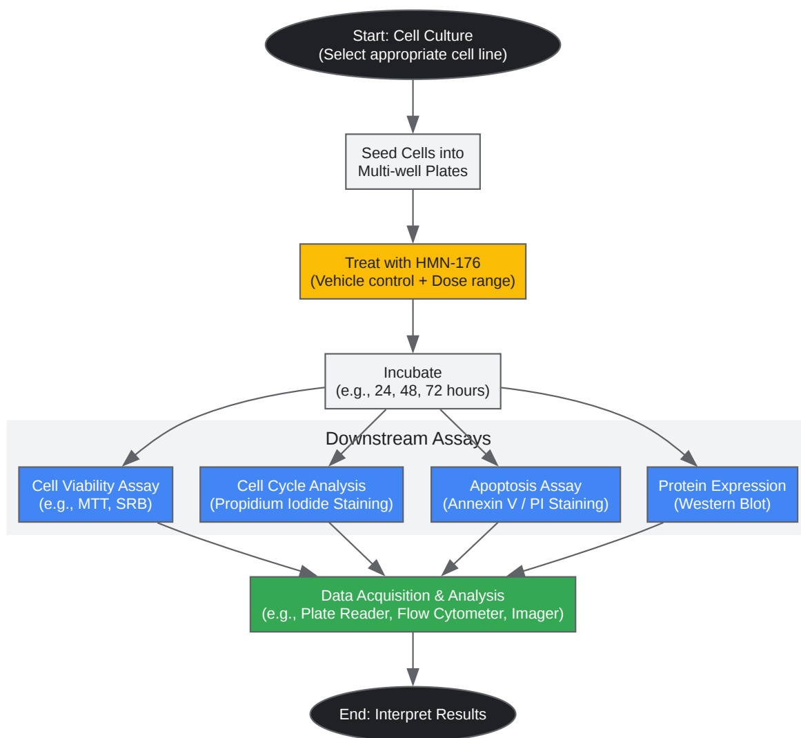
General In Vitro Experimental Workflow for HMN-176

The following are generalized protocols for key in vitro assays. Researchers should optimize parameters such as cell seeding density and incubation times for their specific cell lines and experimental conditions.