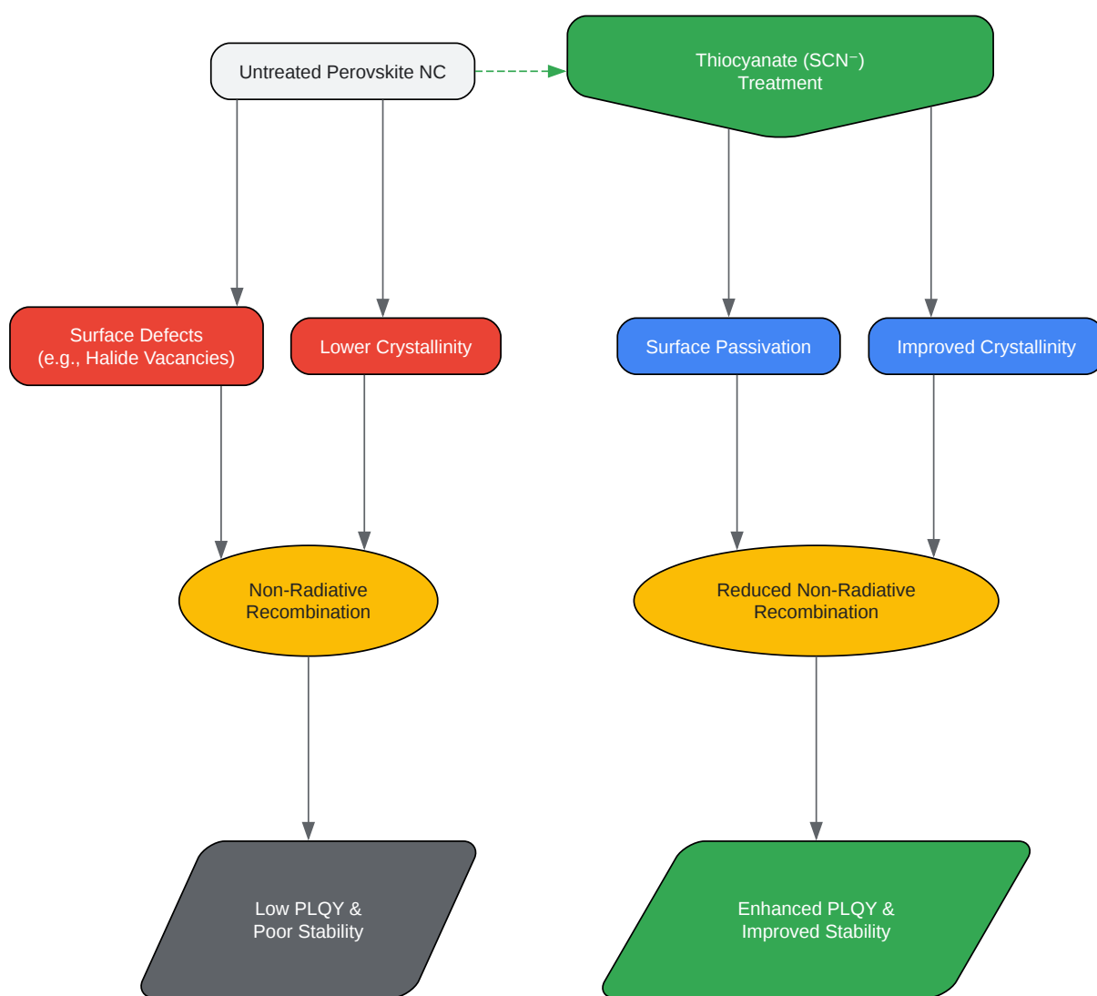
Mechanism of Luminescence Enhancement by Thiocyanate

Caption: Experimental workflow for the synthesis of thiocyanate-incorporated perovskite nanocrystals.