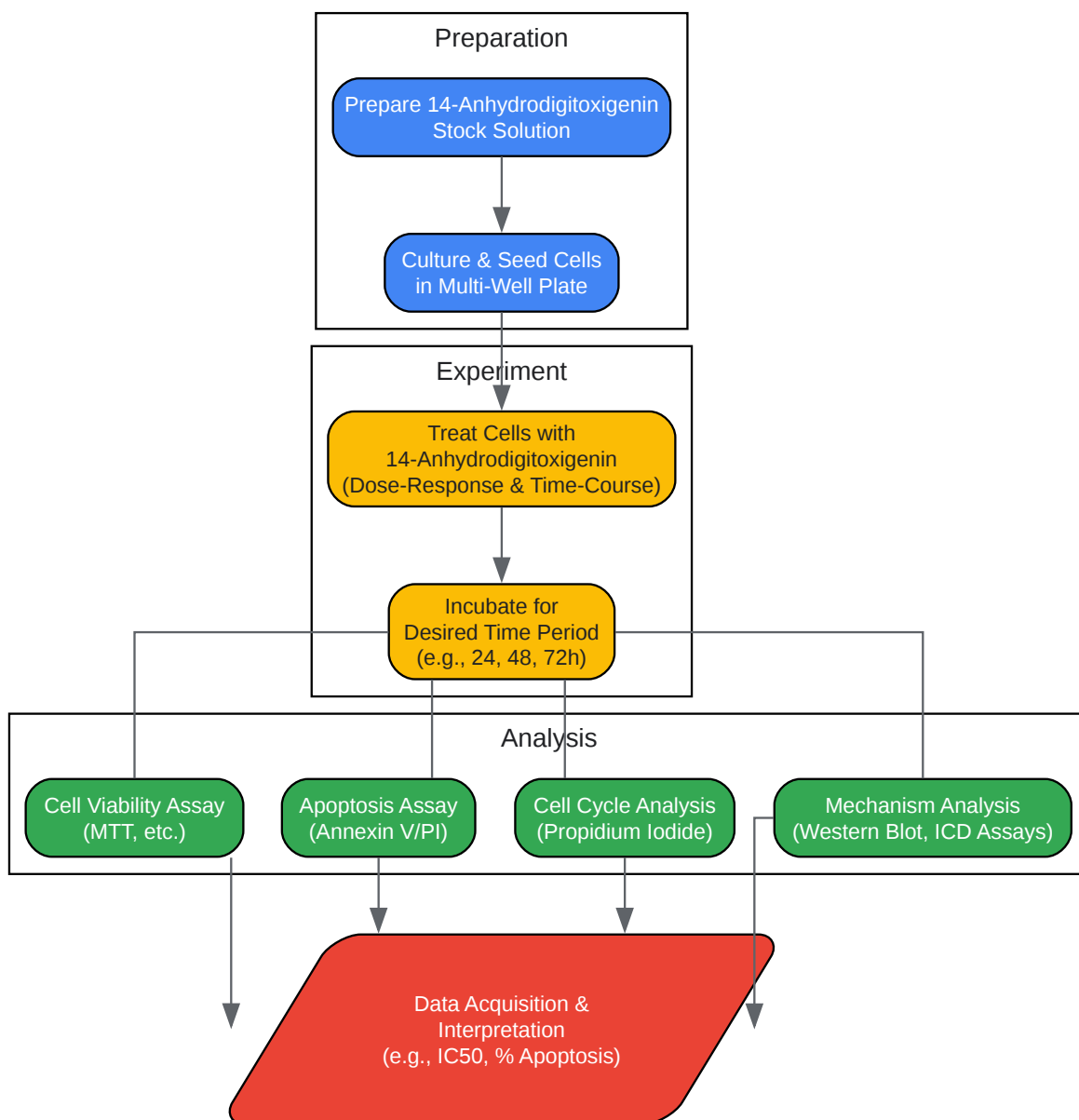
Figure 2: General Experimental Workflow

Click to download full resolution via product page