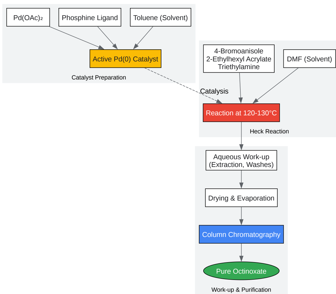
Figure 1. Experimental Workflow for Octinoxate Synthesis

Click to download full resolution via product page