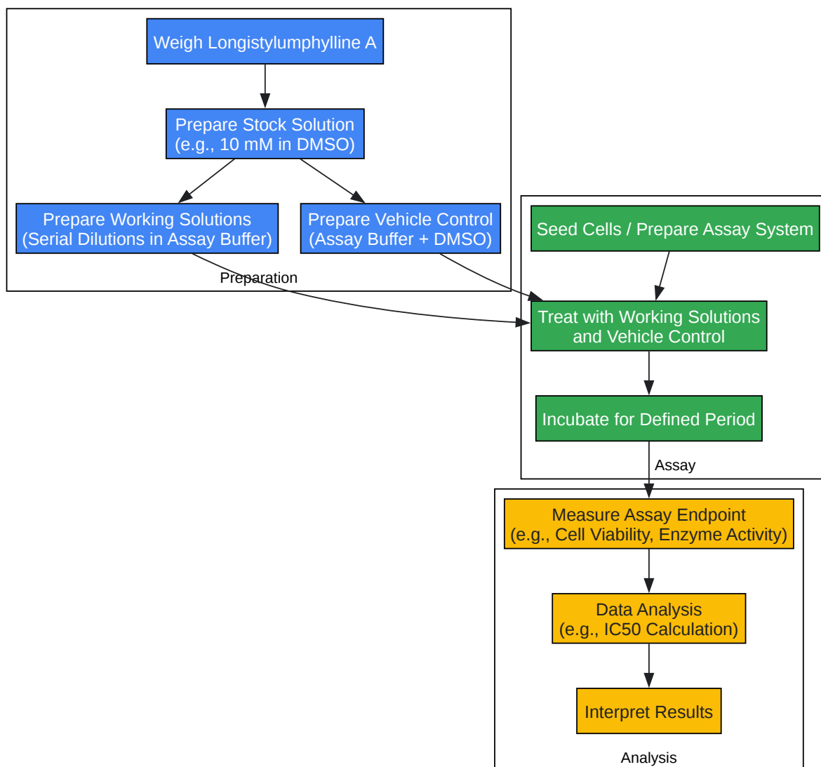
Figure 2: Experimental Workflow for In Vitro Screening

Click to download full resolution via product page