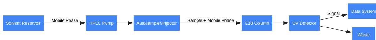
Figure 2: Logical Diagram of HPLC System Components

Click to download full resolution via product page