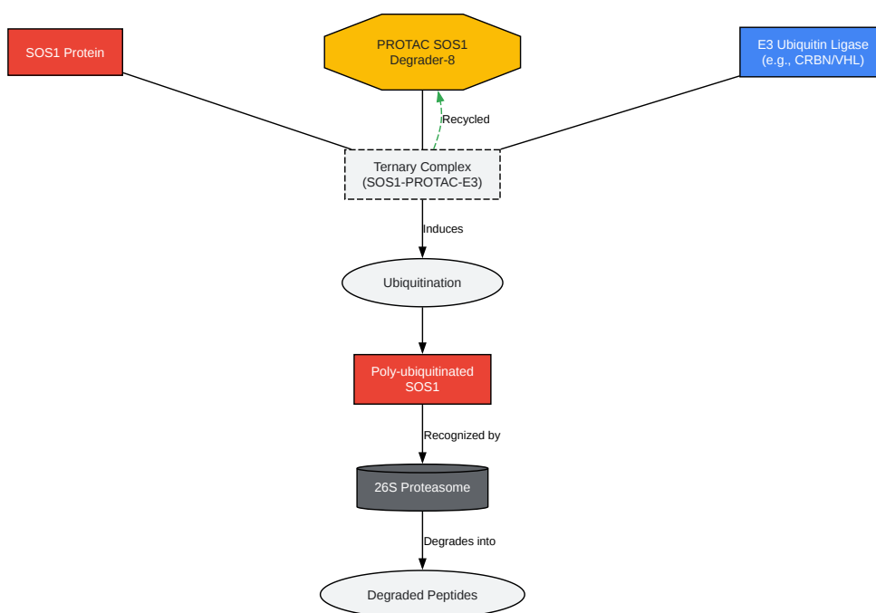
PROTAC SOS1 Degradar-8 Mechanism of Action