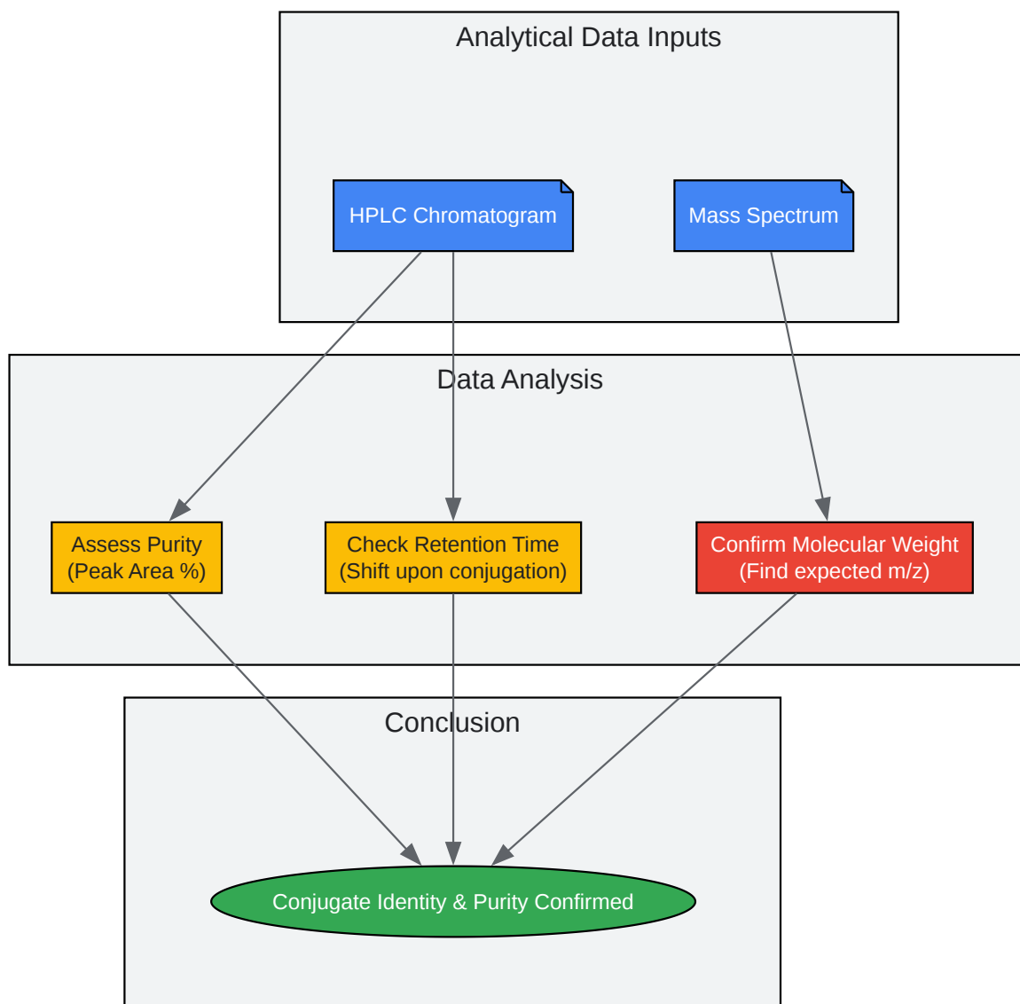
Logical Flow of Data Interpretation

Click to download full resolution via product page