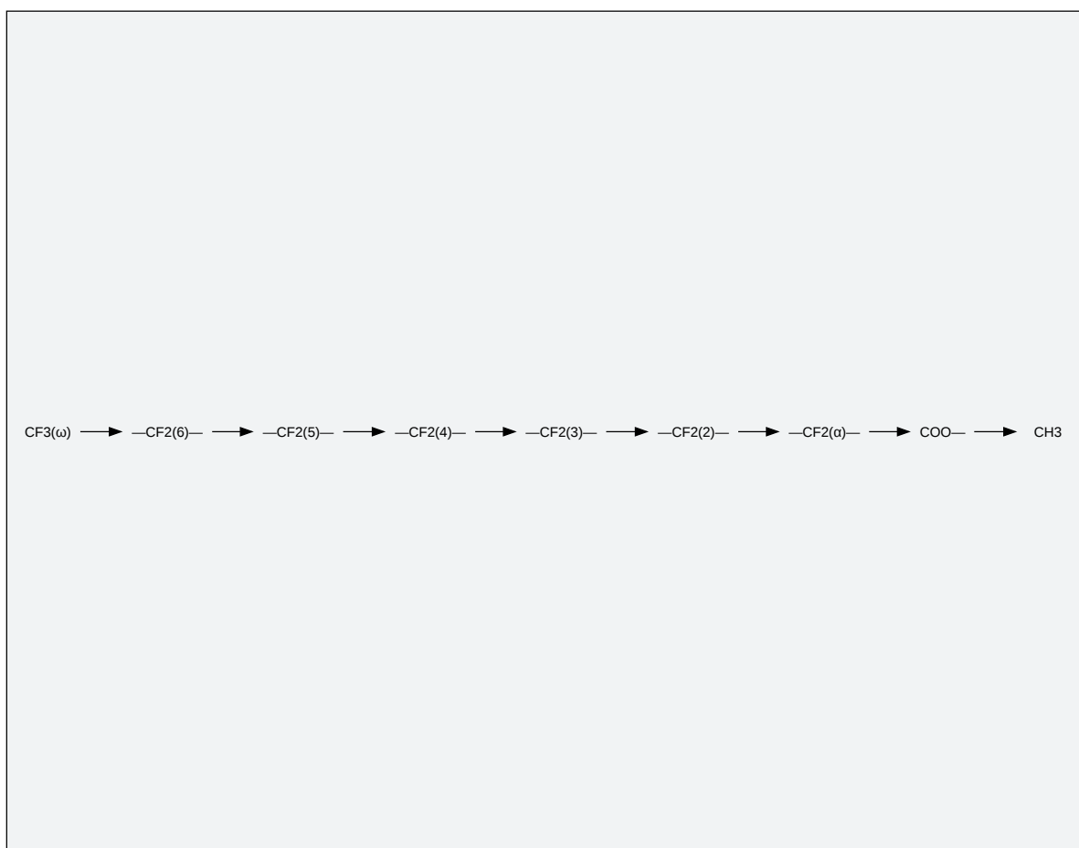
Methyl Perfluorooctanoate Structure