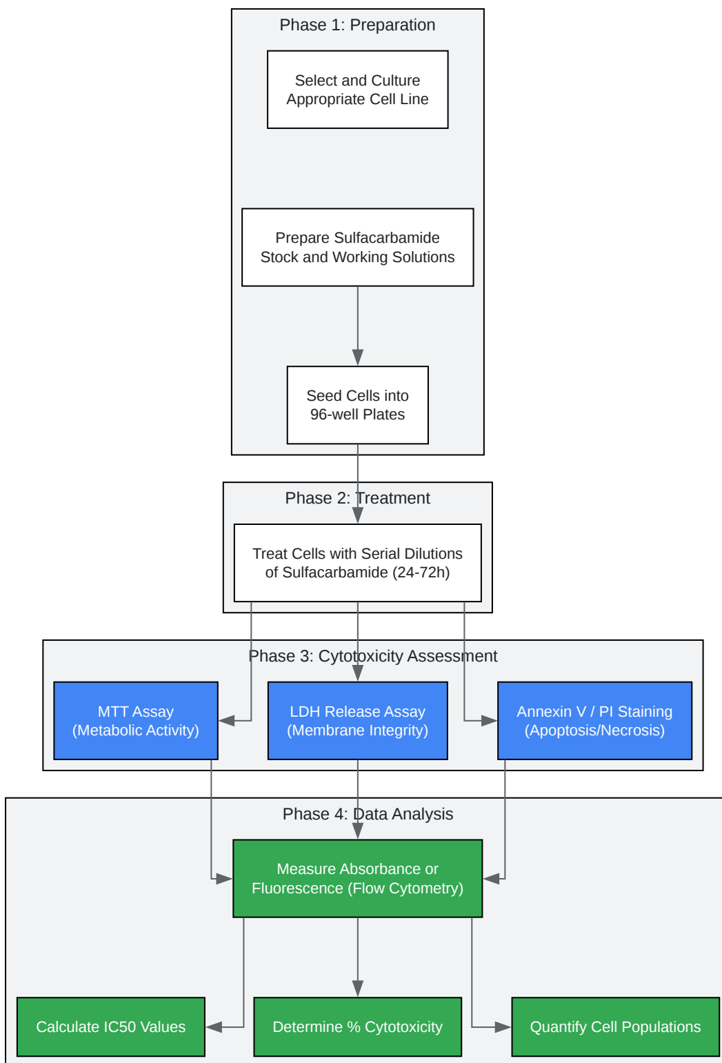
Experimental Workflow for Sulfacarbamide Cytotoxicity Assessment

comprehensive view of the cytotoxic mechanism, distinguishing between effects on cell metabolism, membrane integrity, and programmed cell death.