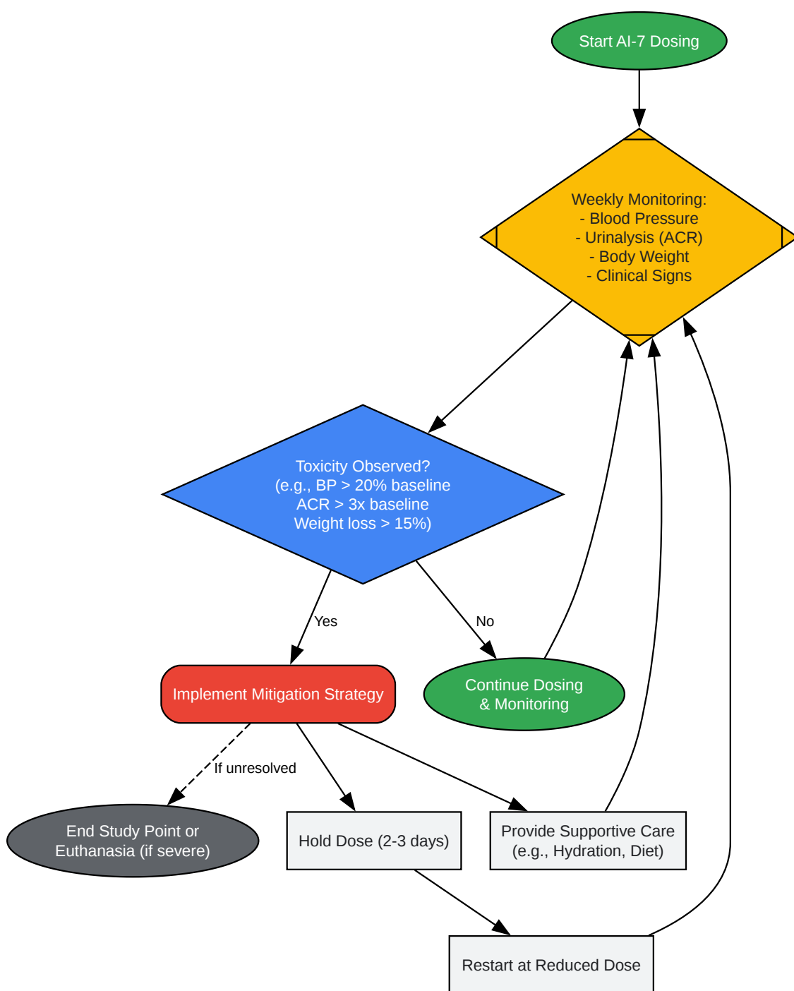
Toxicity Management Workflow in Animal Models

Click to download full resolution via product page