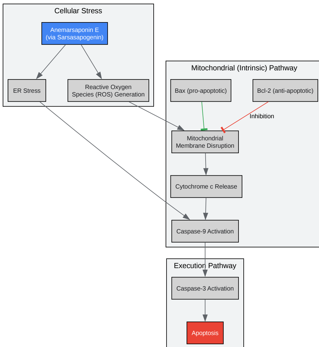
Proposed Signaling Pathways Modulated by Anemarsaponin E Aglycone

Click to download full resolution via product page