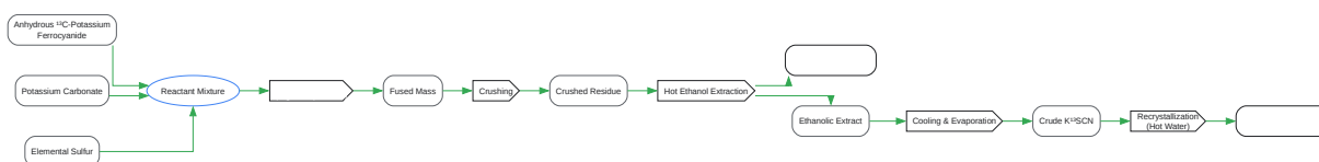
Diagram 2: Synthesis of K^{13}SCN via Fusion Method

Click to download full resolution via product page