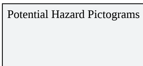
Diagram 1: Potential GHS Pictograms for Reactive Dyes

Click to download full resolution via product page