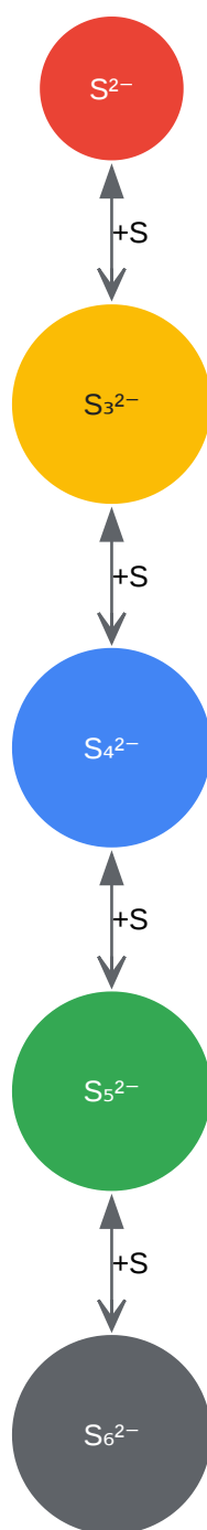
Figure 3: Equilibrium relationships between different polysulfide species.

Click to download full resolution via product page