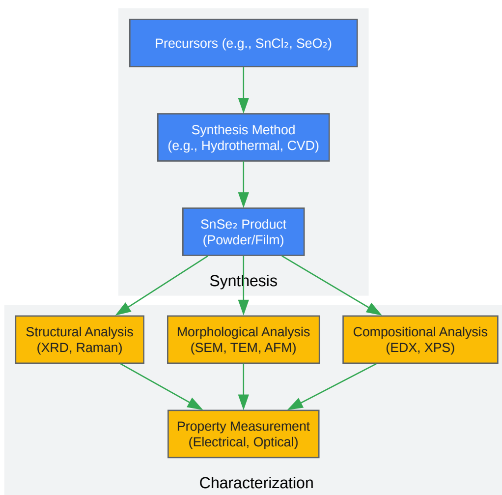
Experimental Workflow for SnSe 2 Synthesis and Characterization

This diagram outlines the logical flow from the synthesis of stannic selenide to its comprehensive characterization.