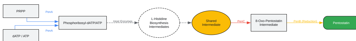
Diagram 1: Proposed Pentostatin Biosynthetic Pathway

Click to download full resolution via product page