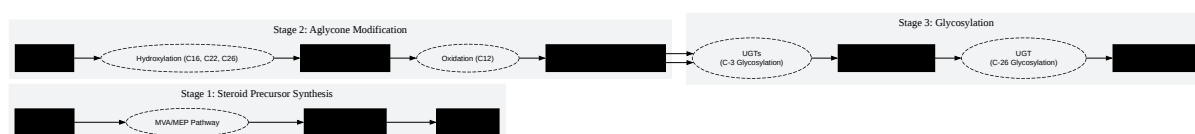
Diagram: Proposed Biosynthetic Pathway of Macrostemonoside I

The final stage involves the attachment of sugar moieties to the steroidal aglycone, a process catalyzed by UDP-dependent glycosyltransferases (UGTs)[10]. This glycosylation step is crucial for the compound's stability, solubility, and biological activity[10]. For Macrostemonoside I , a disaccharide ( \beta -D-glucopyranosyl-(1 \rightarrow 2)- \beta -D-galactopyranoside) is attached at the C-3 position, and a single glucose molecule is attached at the C-26 position[1].