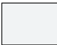
Figure 1: Chemical Structure of Isobutyl Salicylate

Click to download full resolution via product page