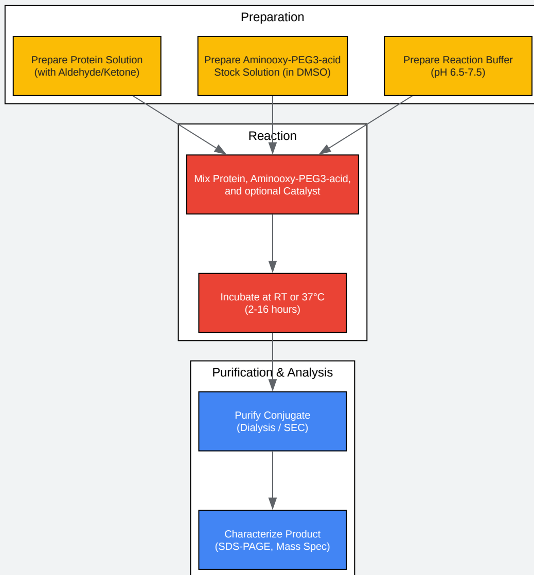
Figure 2: Workflow for Protein Modification

Click to download full resolution via product page