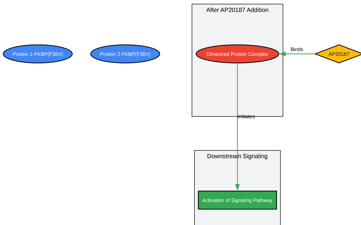
Mechanism of AP20187-Induced Dimerization

Click to download full resolution via product page