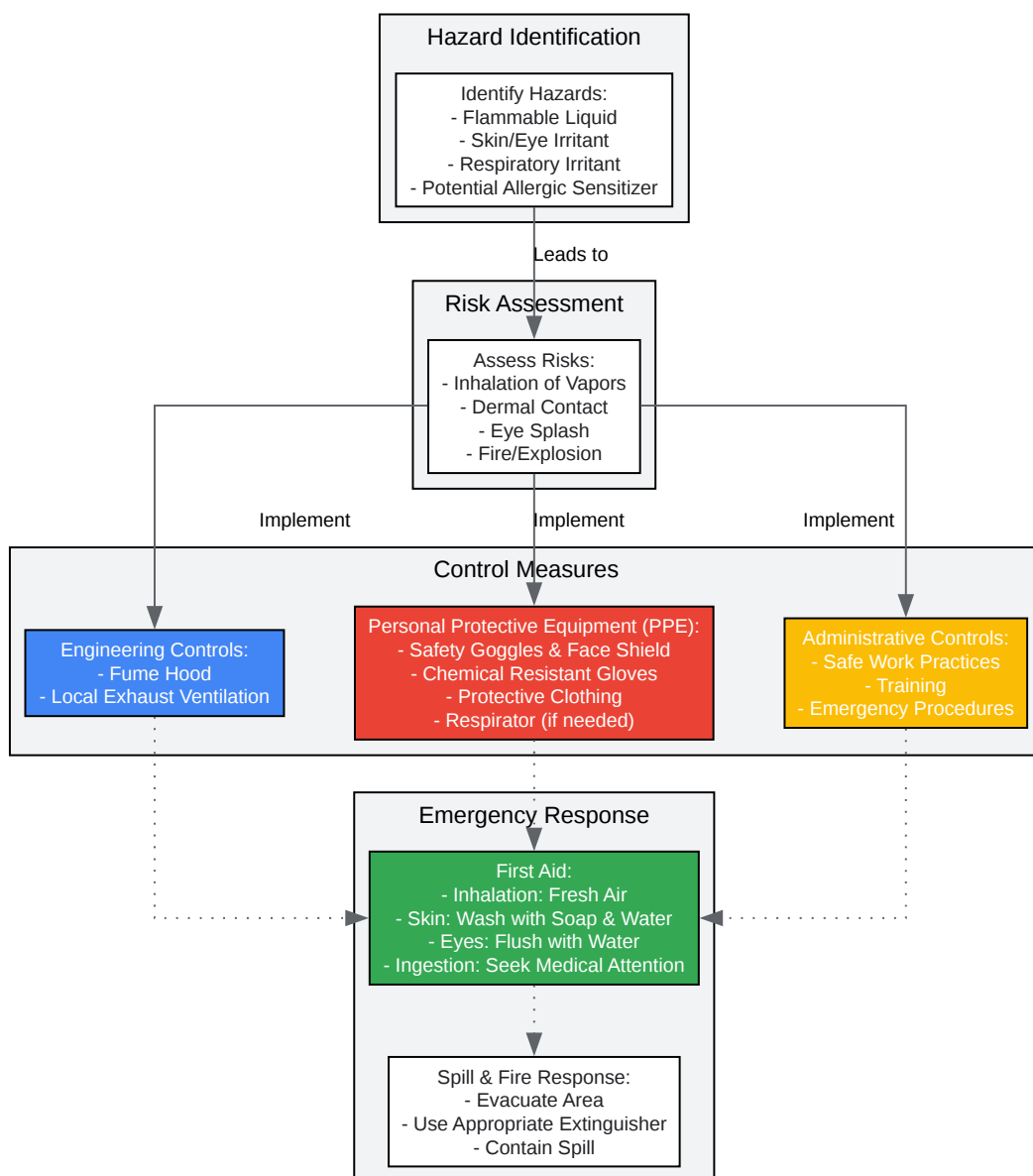
Figure 1: Hazard Management Workflow for 1-Heptanethiol

Click to download full resolution via product page