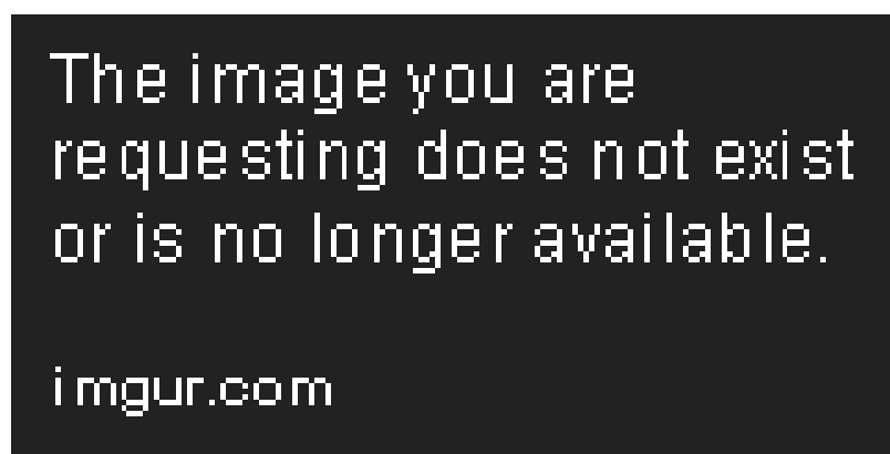
Figure 1: Proposed Chemical

Based on the comprehensive analysis of all spectroscopic data, the structure of Hebeirubescensin H was elucidated as shown in Figure 1.