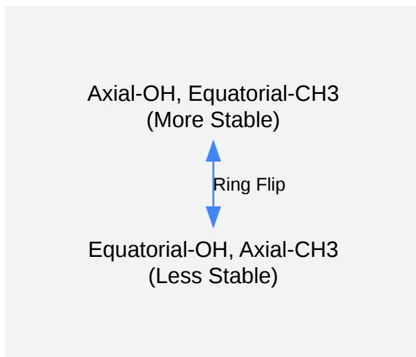
Diagram 2: Conformational Equilibrium of cis- 1,4-Dimethylcyclohexanol

Click to download full resolution via product page