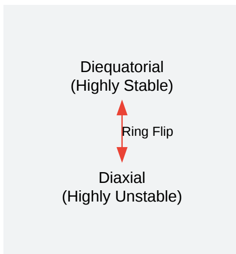
Diagram 3: Conformational Equilibrium of trans- 1,4-Dimethylcyclohexanol

Click to download full resolution via product page