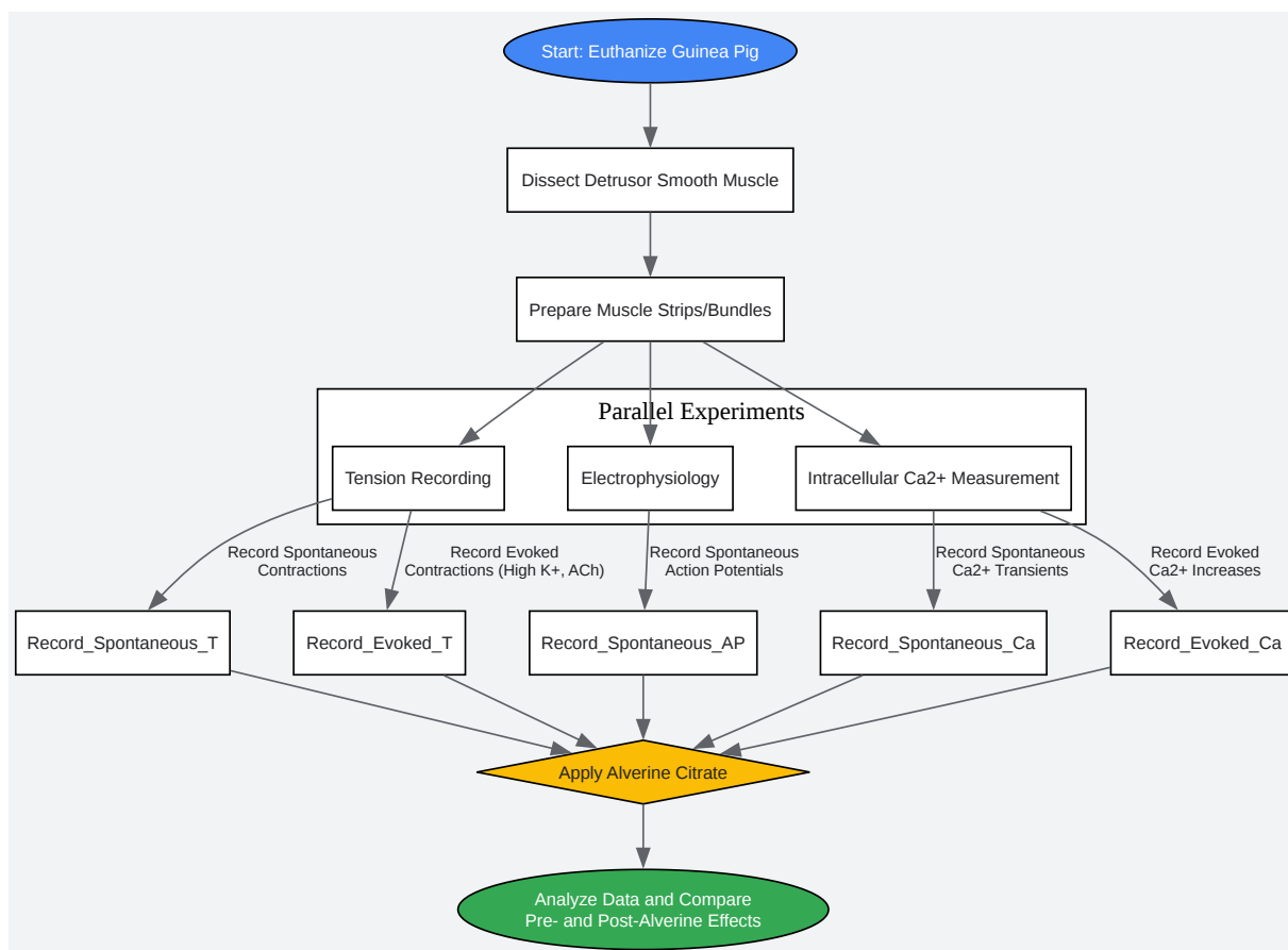
Caption: Alverine's inhibition of the Rho-kinase pathway in evoked contraction.

Click to download full resolution via product page