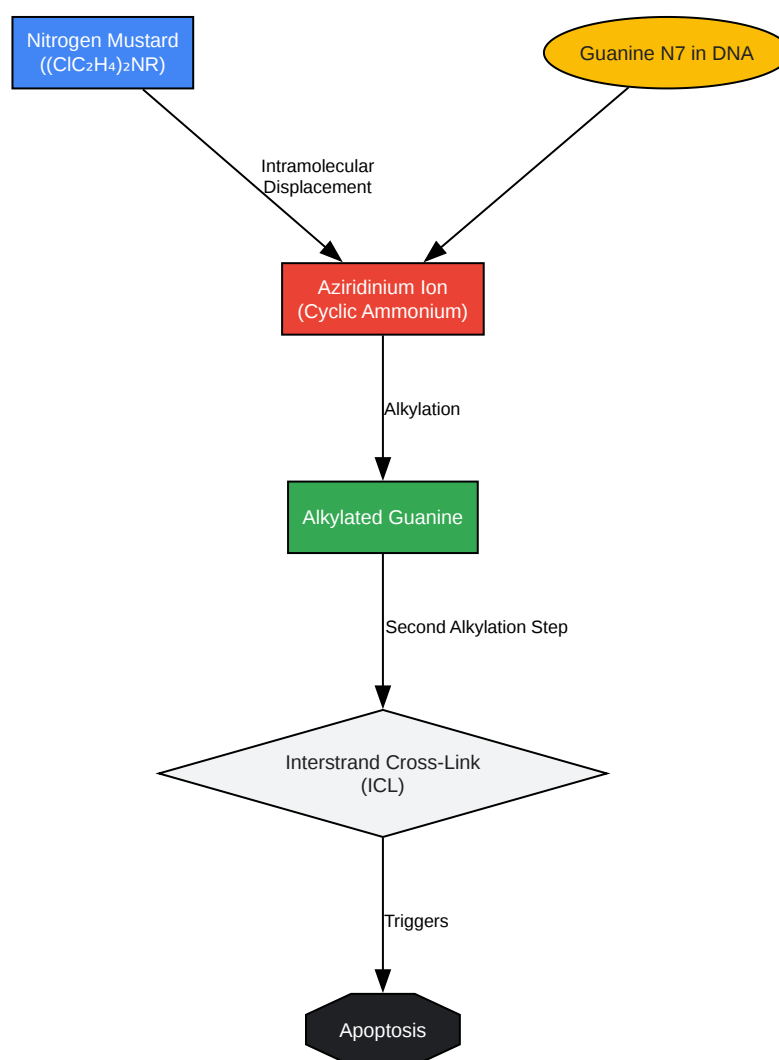
Diagram of the General Mechanism of Action of Nitrogen Mustards

Click to download full resolution via product page