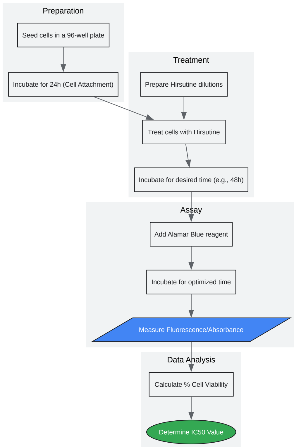
Alamar Blue Assay Workflow for Hirsutine Cytotoxicity

Click to download full resolution via product page