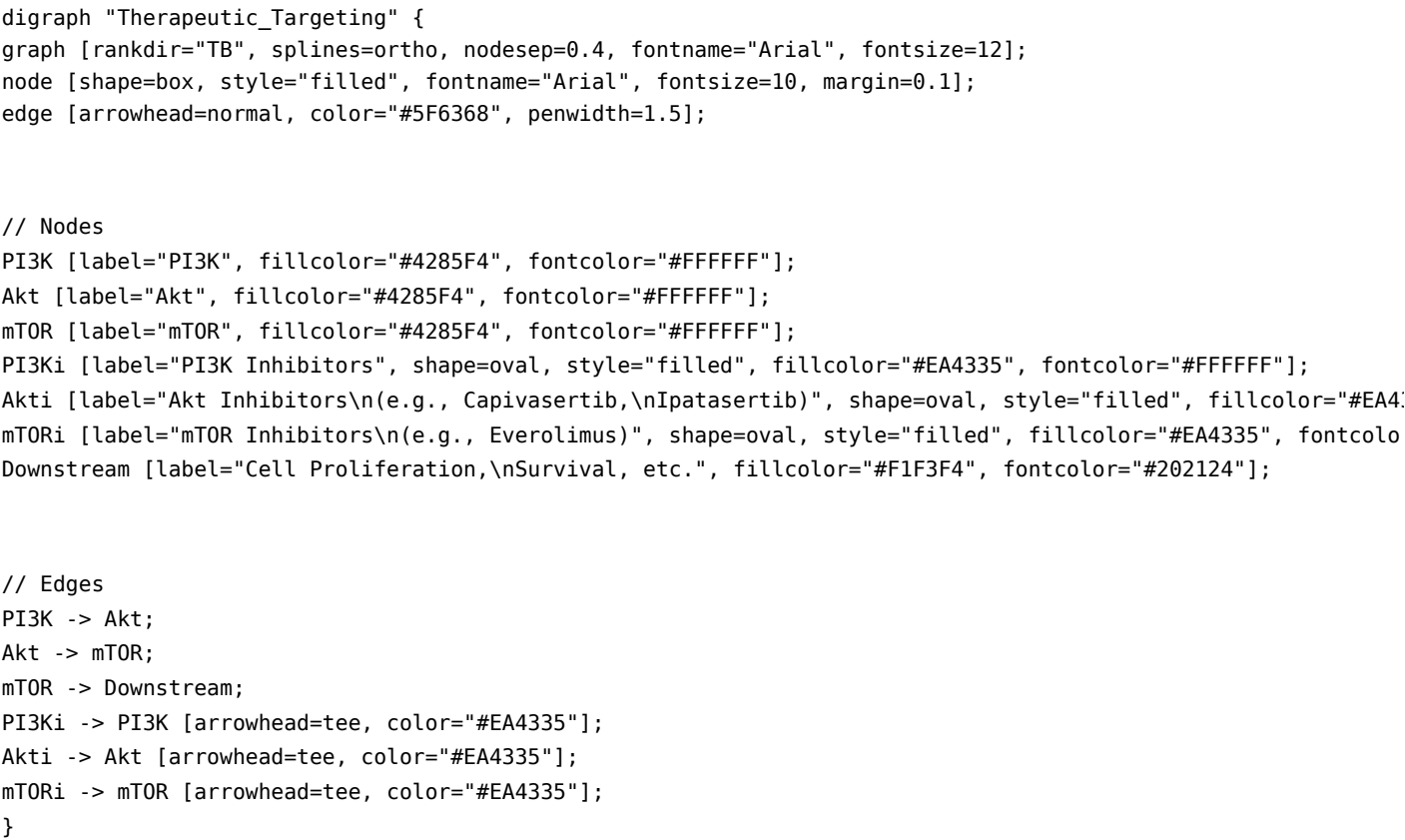
Caption: Therapeutic targeting of the PI3K/Akt/mTOR pathway. (Max Width: 760px)

The dysregulation of the Akt signaling pathway is a cornerstone of the molecular landscape of both breast and prostate cancer. A thorough understanding of this pathway, including the prevalence of key genetic alterations, is paramount for the development of effective targeted therapies. The experimental data presented here provide a framework for the robust investigation of this pathway in both preclinical and clinical settings. The continued development and strategic implementation of novel Akt inhibitors hold significant promise for improving outcomes for patients with these common and challenging malignancies.