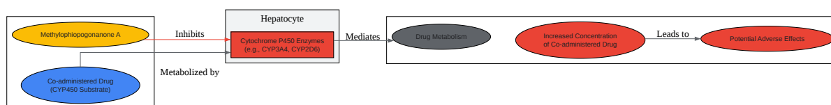
Caption: On-target signaling pathway of Methylophiopogonanone A .

Click to download full resolution via product page