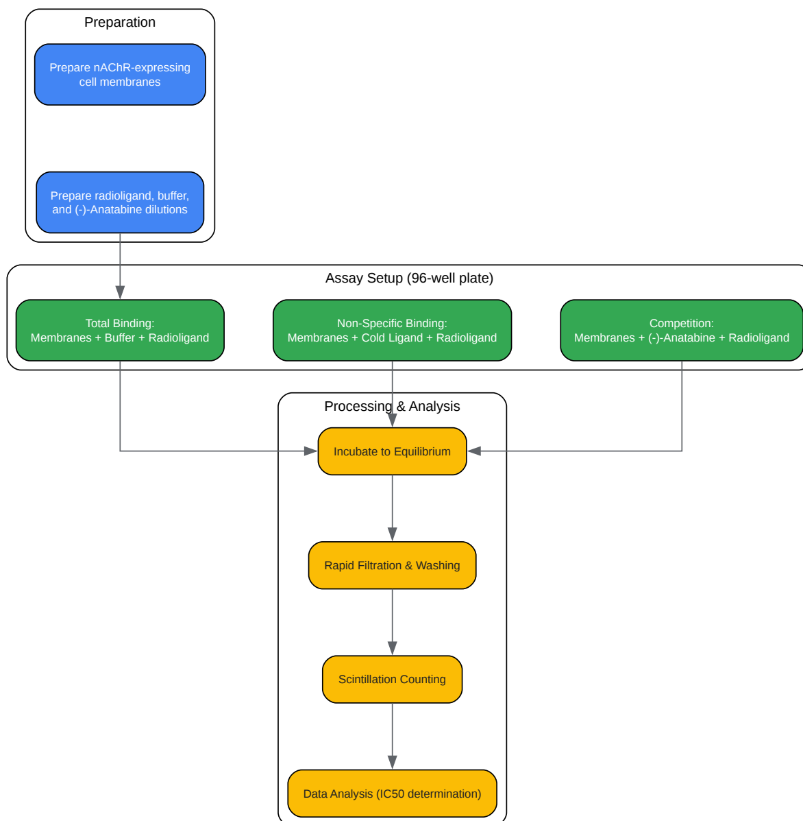
Workflow for a Radioligand Competition Binding Assay

Click to download full resolution via product page