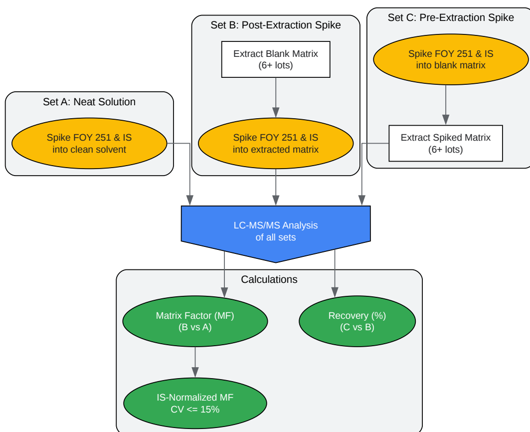
Figure 2: Experimental Workflow for Matrix Effect Assessment

Click to download full resolution via product page