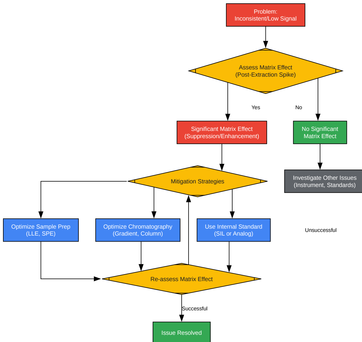
Caption: Workflow for LC-MS analysis of Isoliquiritin Apioside with different sample preparation options.

Click to download full resolution via product page