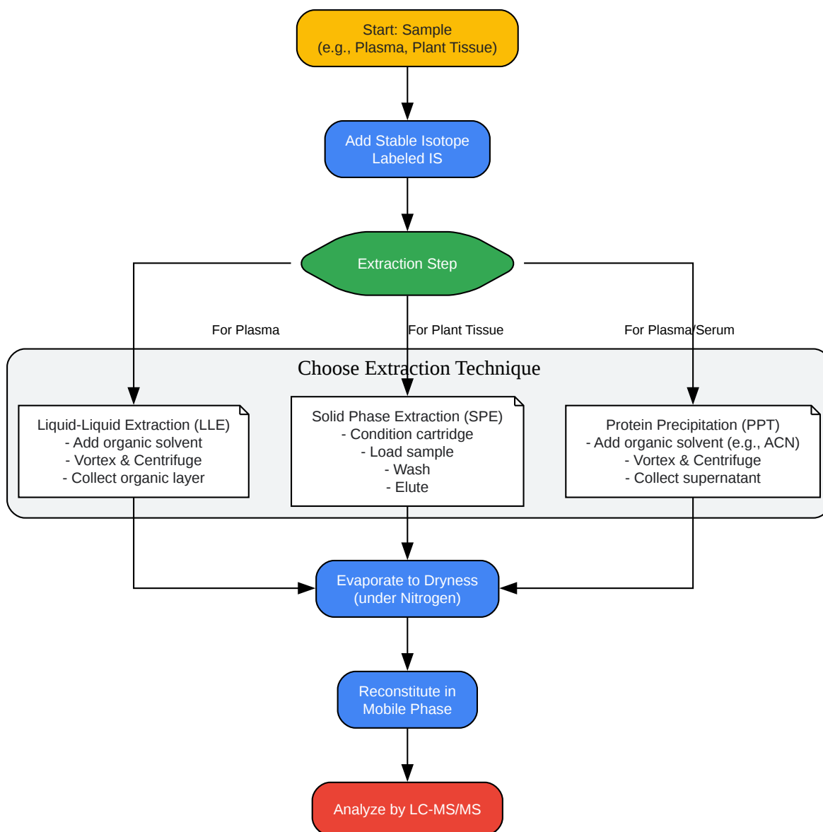
Caption: Troubleshooting workflow for addressing matrix effects.

Click to download full resolution via product page