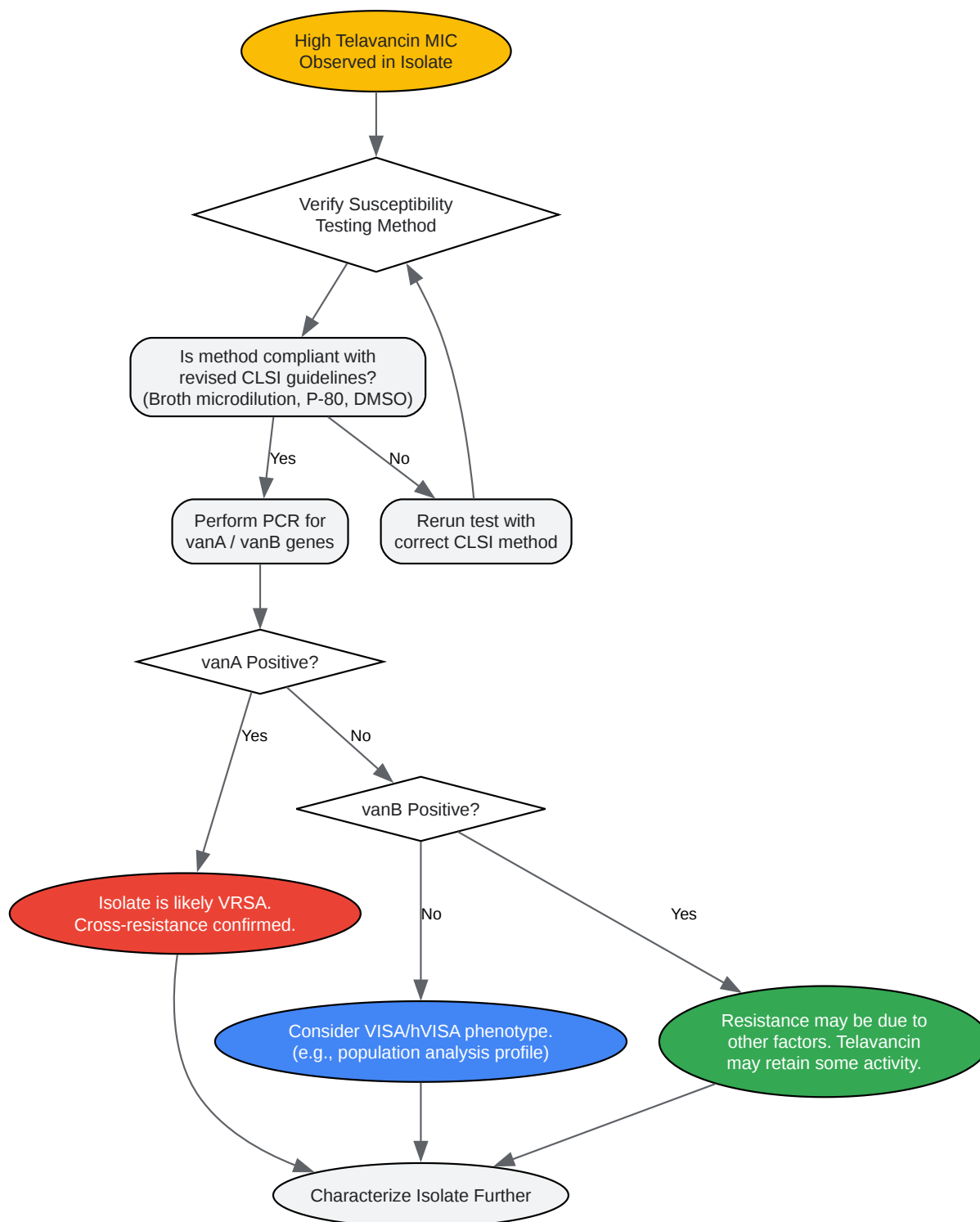
Fig 3. Workflow for Troubleshooting Unexpected Telavancin Resistance

Click to download full resolution via product page