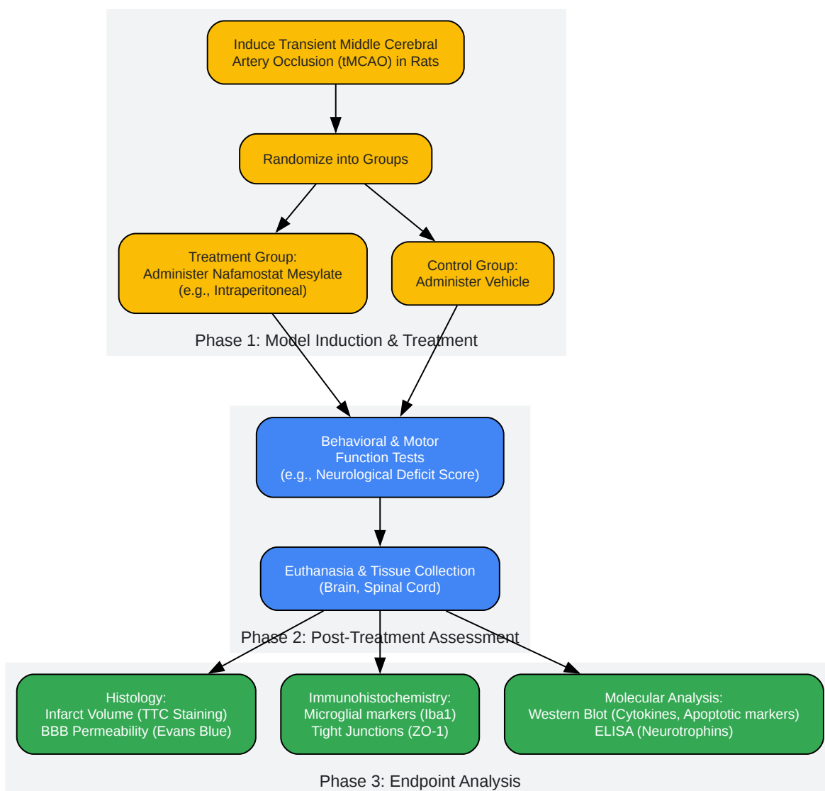
Figure 2: General Experimental Workflow for In Vivo tMCAO Model

Click to download full resolution via product page