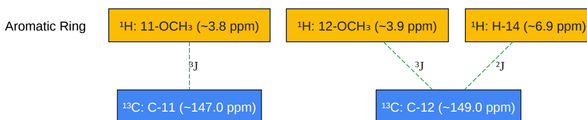
Figure 2: Key HMBC Correlations for Dimethyl Isorosmanol

The final confirmation of the structure, particularly the location of the methyl groups, is achieved through 2D NMR, primarily HMBC. The diagram below illustrates the key expected HMBC correlations that would confirm the positions of the two methoxy groups.