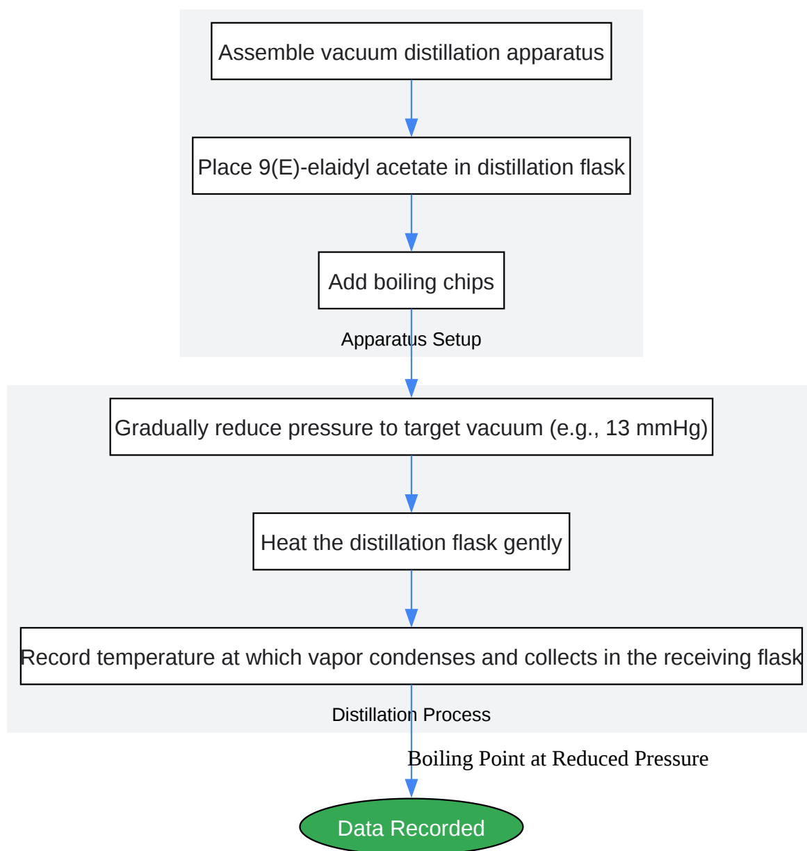
Figure 1. Workflow for Boiling Point Determination.