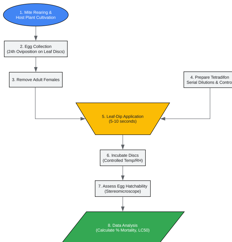
Figure 2: Workflow for Ovicidal Bioassay

Click to download full resolution via product page