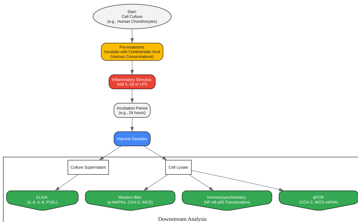
Figure 3: General In Vitro Experimental Workflow

Click to download full resolution via product page