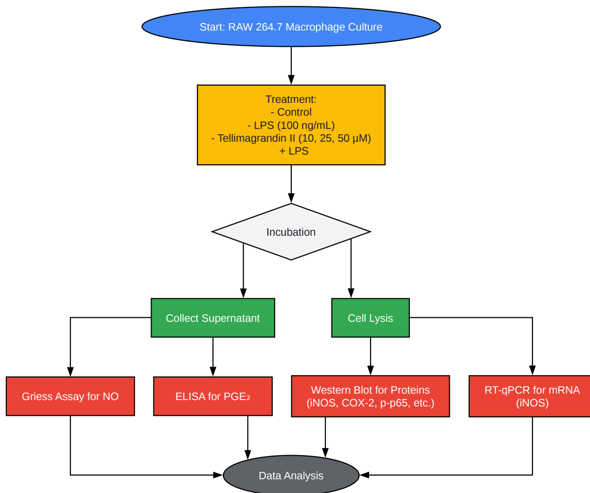
Figure 1: Simplified signaling pathway of LPS-induced inflammation and inhibition by Tellimagrandin II .

Click to download full resolution via product page