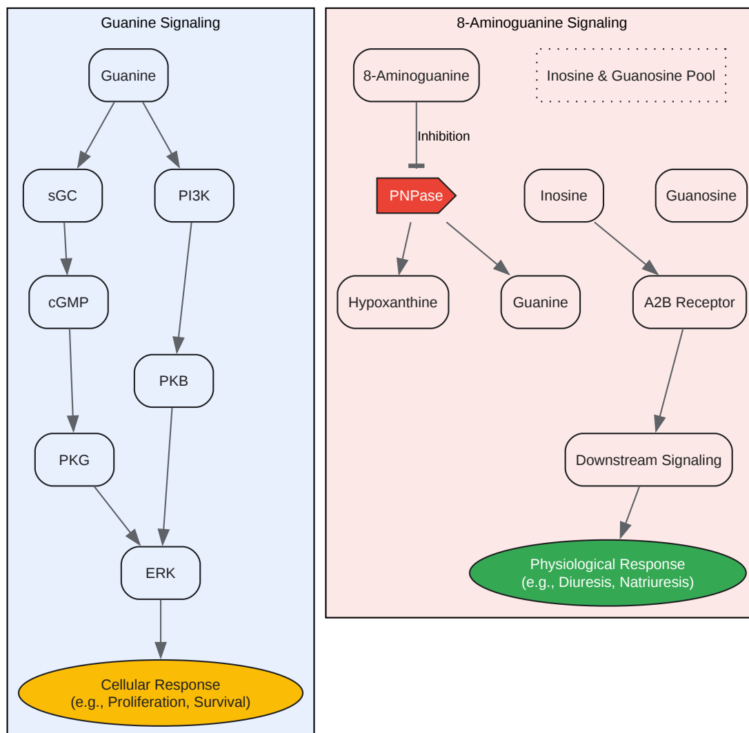
Comparative Signaling Pathways

Click to download full resolution via product page