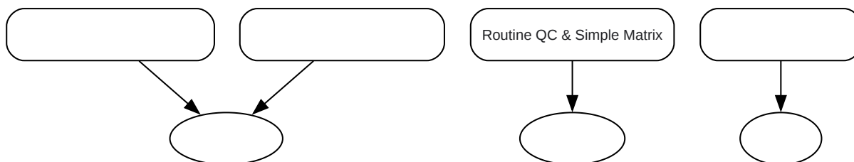
Caption: Experimental workflow for narceine quantification.

Click to download full resolution via product page