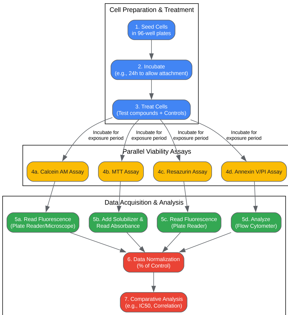
Diagram 2: Experimental Workflow for Cross-Validation

Click to download full resolution via product page