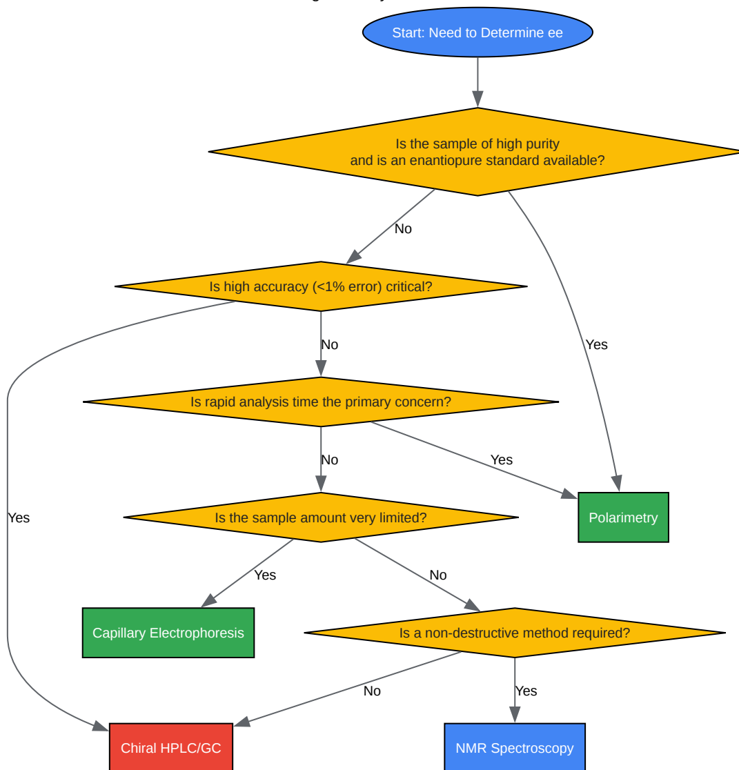
Decision Tree for Selecting an Analytical Method for ee Determination

Click to download full resolution via product page