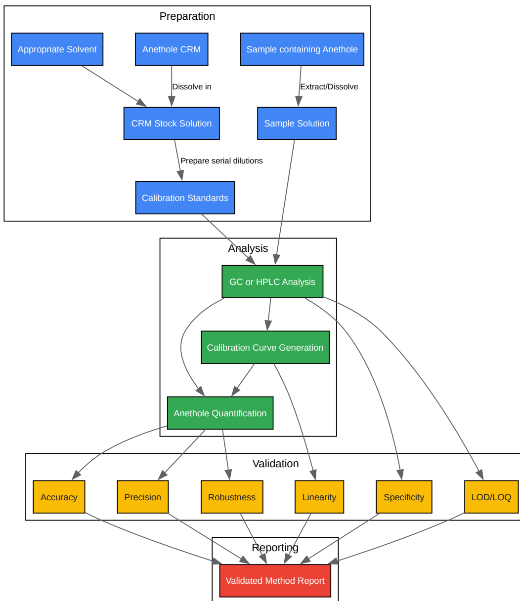
Workflow for Anethole Quantification Method Validation Using a CRM

Click to download full resolution via product page