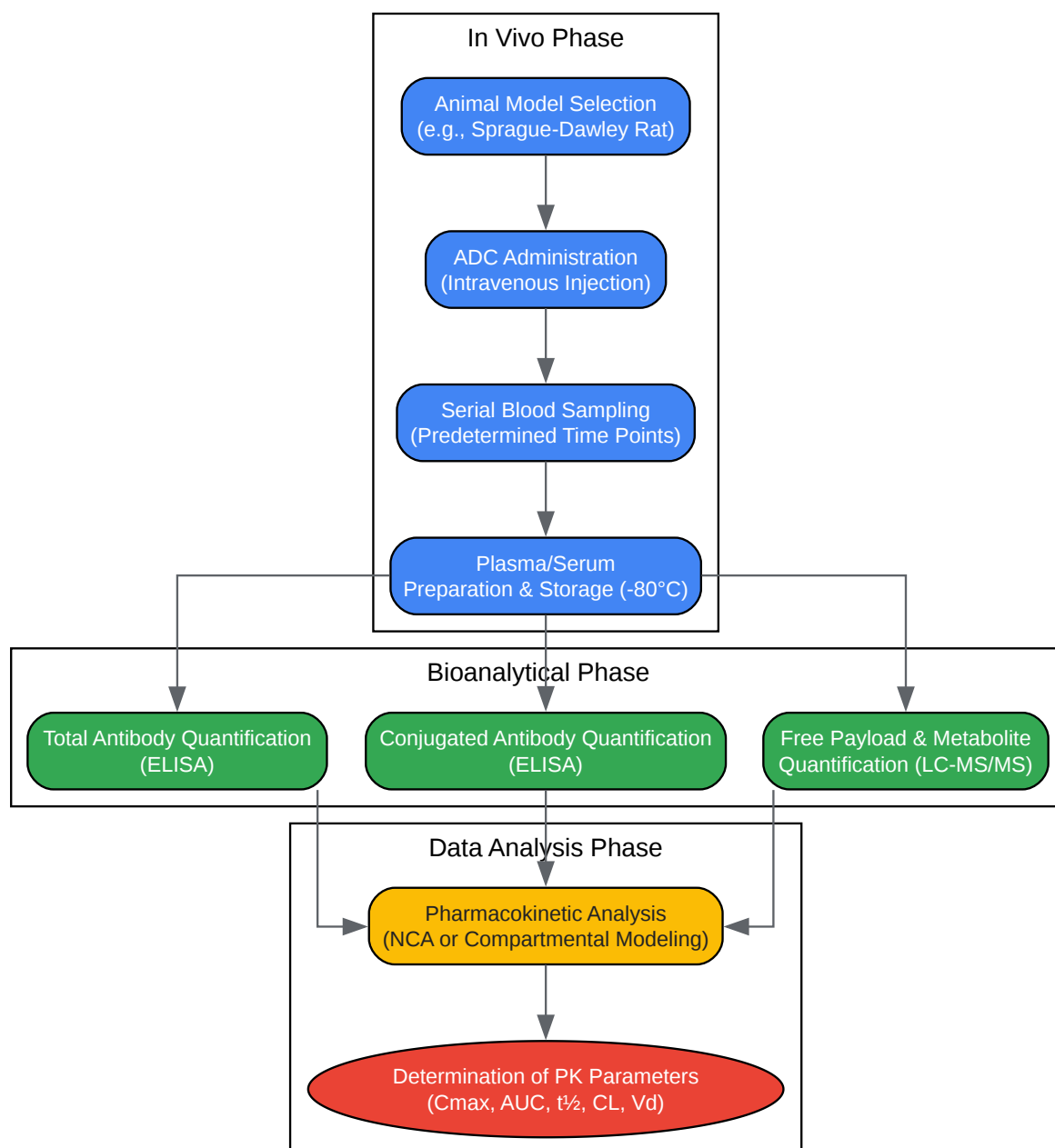
Experimental Workflow for ADC Pharmacokinetic Study

Click to download full resolution via product page