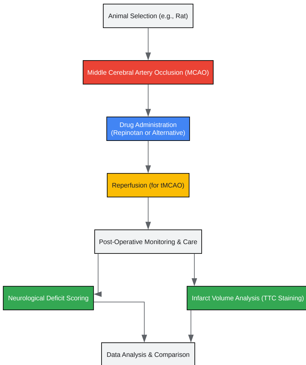
Experimental Workflow for Preclinical Stroke Study

Click to download full resolution via product page