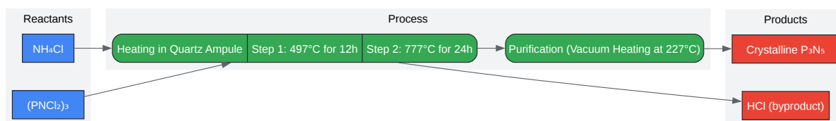
Caption: Ammonolysis of Phosphorus Pentachloride Workflow

Click to download full resolution via product page