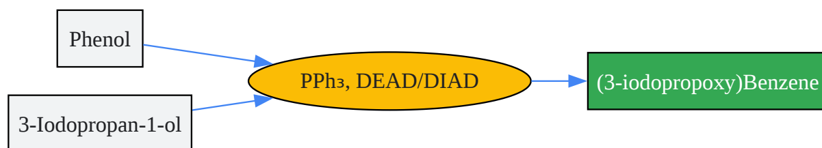
Diagram 2: Williamson Ether Synthesis of (3-iodopropoxy)benzene .

Click to download full resolution via product page